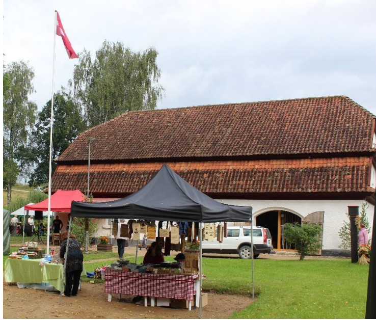
Craft market in Padure, Fun Machine Fair 2020