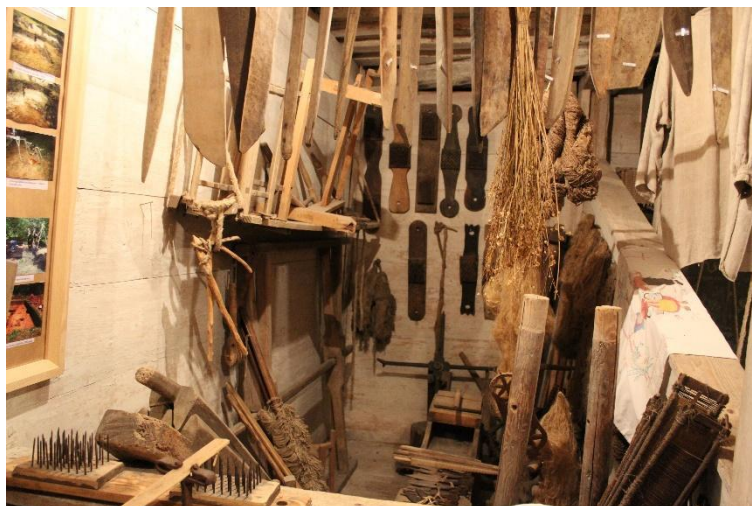
Museum in Padure Barn, September 2020